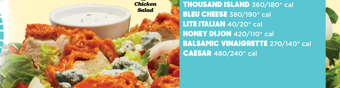
Buffalo Chicken Salad

Chopped romaine, Parmesan cheese and crispy seasoned croutons with a creamy Caesar dressing. Topped with grilled or fried chicken. Grilled 890 cal | Fried 930 cal = 13.89/14.41 Salad only, hold the chicken 610 cal = 9.69/10.05