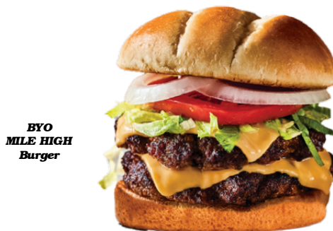
BYO Mile High Burger