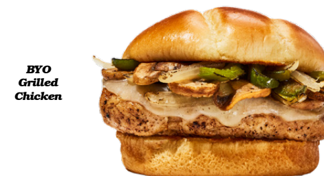
BYO Grilled Chicken