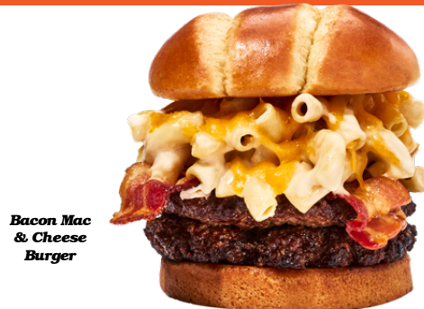
Bacon Mac & Cheese Burger