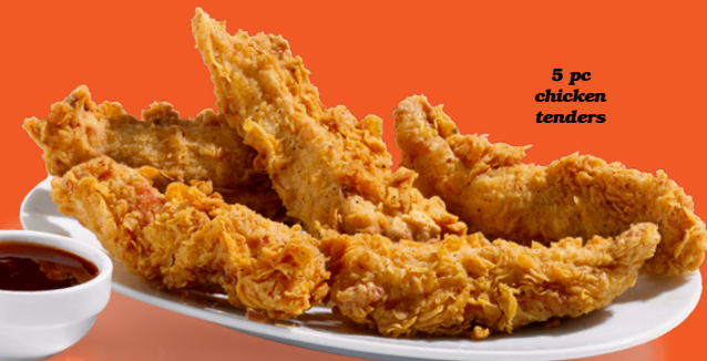
5 pc chicken tenders

Just when you thought we clucked through every idea, we come hot and crispy with another one. Tenders come with choice of one dipping sauce. Choose from Ranch, Bleu Cheese, or any of our signature wing sauces,