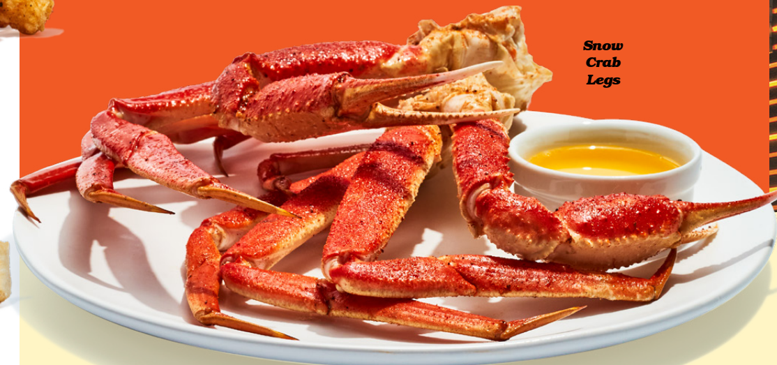
Snow Crab Legs

1 lb | 520 cal = market price when available